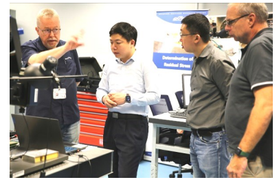
GF+ Machining Solutions