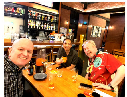
HAECO Xiamen visit

ASRC News Issue #21 April 2024 — June 2024