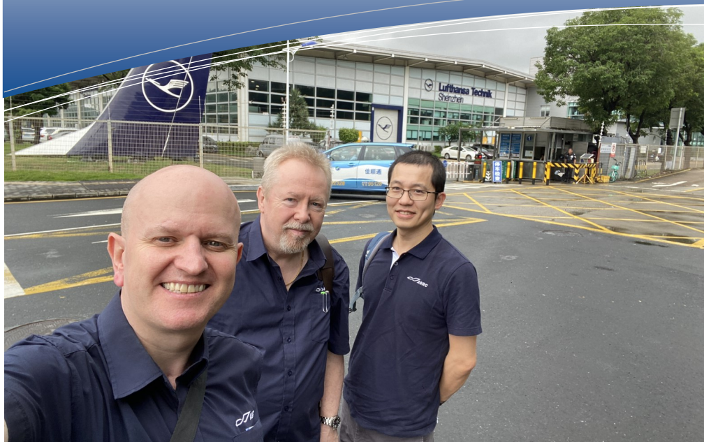
ASRC Staff at Lufthansa Technic Shenzhen, China