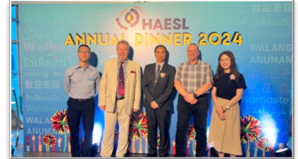
HAESL Annual Dinner