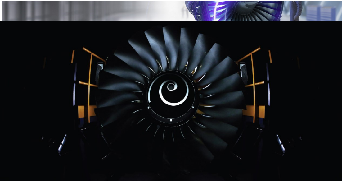
ASRC Staff won 2nd Runner up in Photo Competition